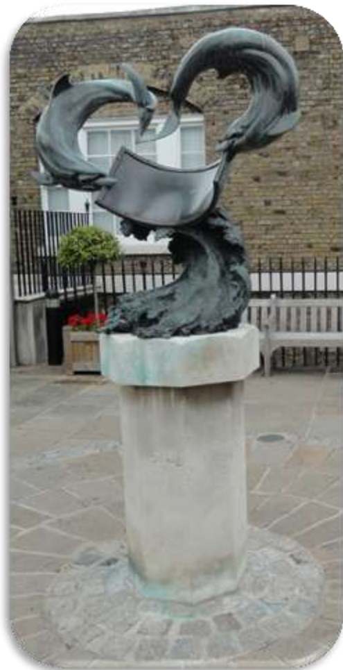
Dolphin Sundial Greenwich, London England