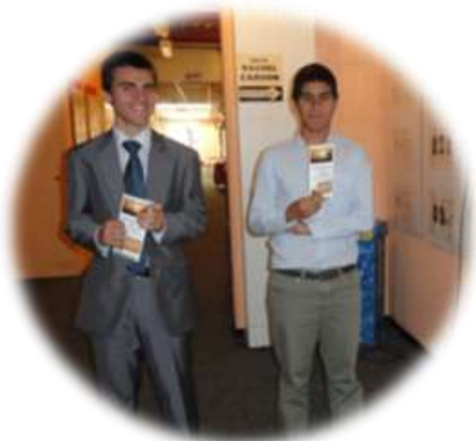
Youth stationed at their assigned posts of duty

This is why we really need your help. Are you prepared to step up to the plate and meet this challenge to bring the message of a living Savior to the very people that had such an effect on the in the past as well as today? In modern times, this city is so multicultural that the effect of a strong church presence in that city will reach to every nation around the globe.