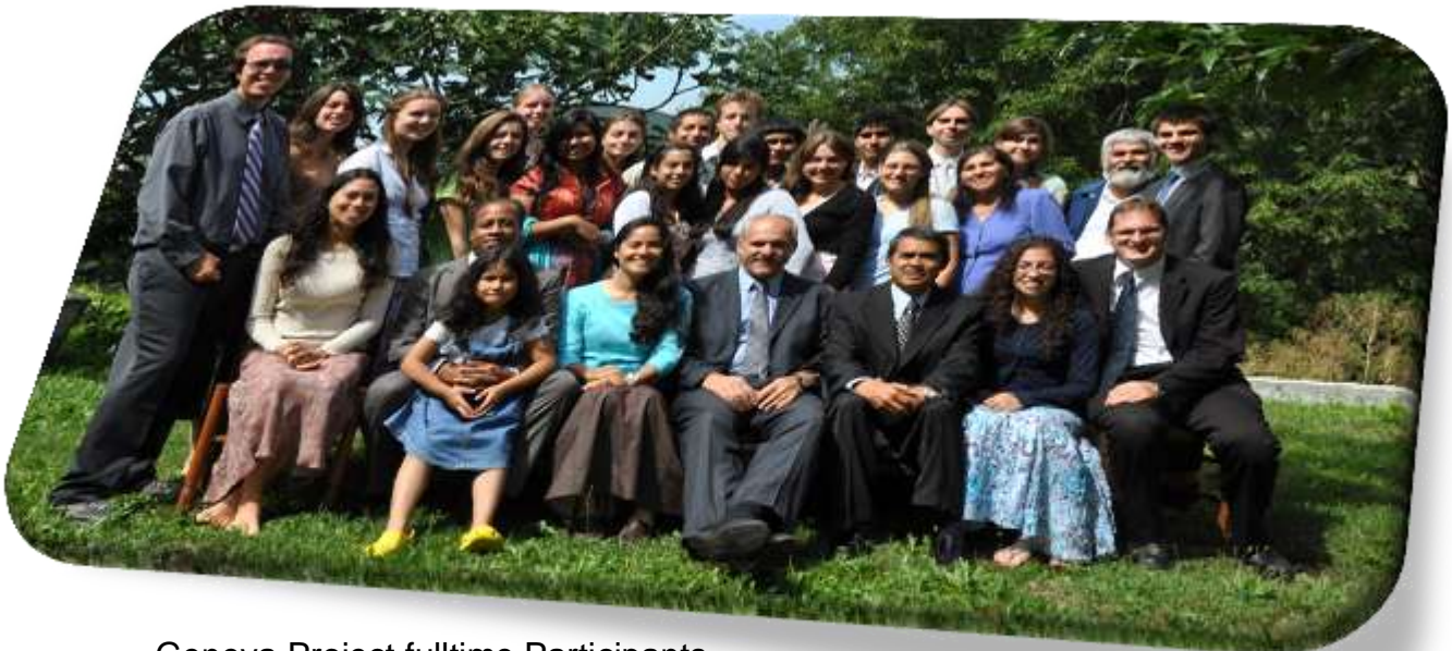
Geneva Project fulltime Participants

Three years ago our special evangelism project was held in Geneva, Switzerland—one of the birth places of the Protestant Reformation. We are so thankful that nearly 30 youth had risen to the challenge and