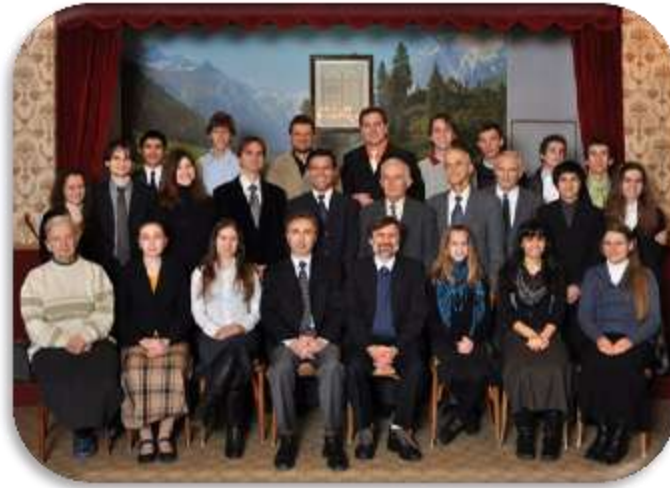
Svjetionik Missionary School Osijek, Croatia

As a people preparing for the second coming of Jesus, we owe a debt of gratitude to the island off the north western coast of Europe. Before the Protestant Reformation was begin by